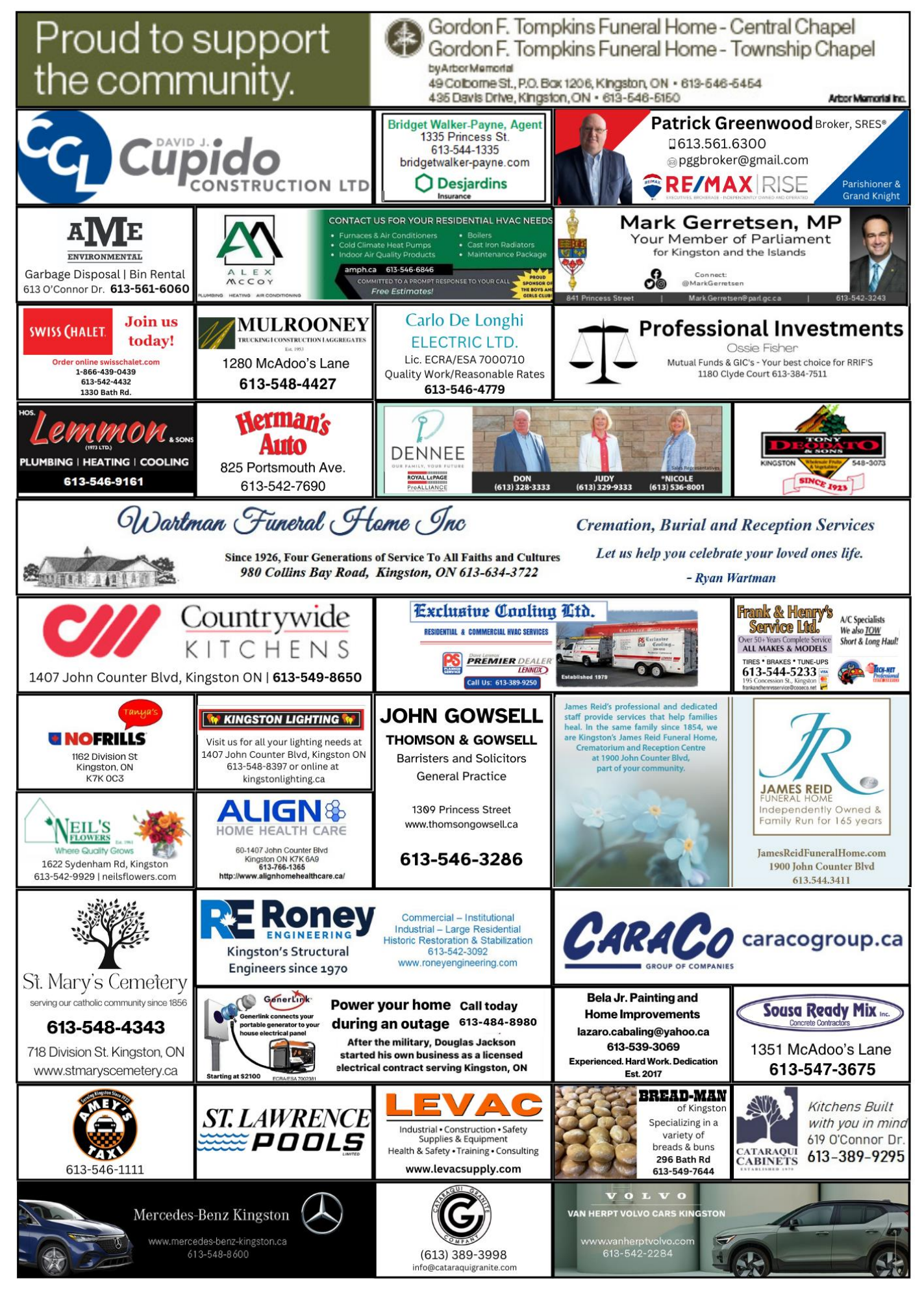
Our bulletin is sponsored by Knights of Columbus St. Joseph's Council #11670. For advertising contact the parish office.