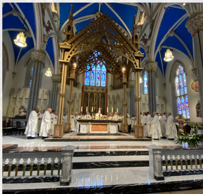
Patronal Feast of the Archdiocese of Kingston, the Solemnity of the Immaculate Conception, December 8, 2025

On January 27, 1826, the Diocese of Kingston came into existence through the signing of a Papal Bull by Pope Leo XII. We officially opened our 200th anniversary celebration on our Patronal Feast Day, December 8, 2025, blessed with a beautiful but chilly late fall day. It was a joyous occasion in the newly renovated Cathedral. I am grateful to all who were able to participate in person and those who offered spiritual support from afar. The Icon, written for the anniversary theme, “to Know Christ and the power of His resurrection” (Phil 3:10), was consecrated during the liturgy and is now displayed at the Cathedral for veneration.