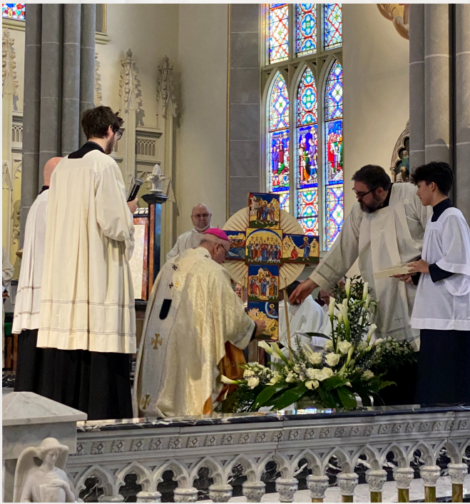
Consecration of the Icon, "To know Christ and the power of His resurrection" (Phil 3:10)

We have received from the Apostolic Nunciature of the Vatican a decree of Indulgence for the faithful celebrating the 200 th Anniversary of the Archdiocese of Kingston. Throughout 2026, a plenary indulgence will be available to those who visit any of the five dedicated pilgrimage churches of the archdiocese, pray the 200 th Anniversary Prayer, and meet the standard terms of receiving indulgences (receive Holy Communion, pray at least two prayers for the intentions of Pope Leo XIV, receive the Sacrament of Reconciliation within 21 days, and be detached from sin).